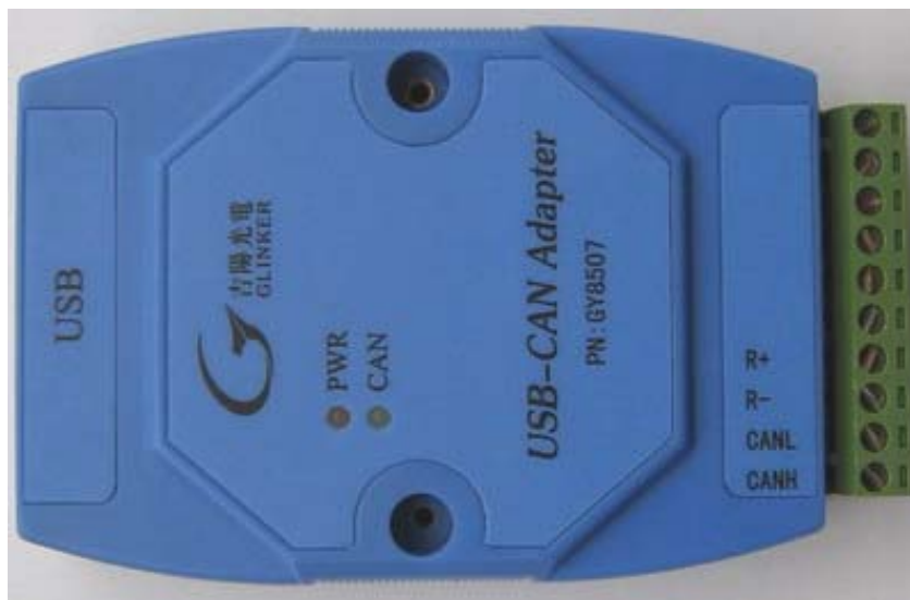
Picture 1 appearance of GY8507